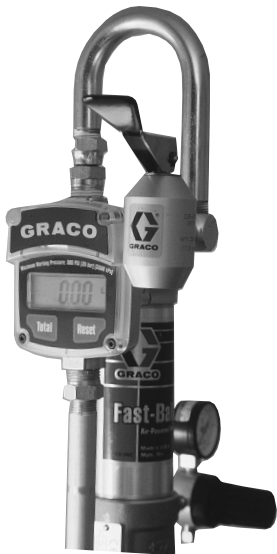
On a metered tapper . . .