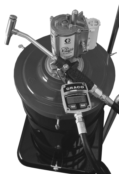
On a portable 3:1 gear luber . . .